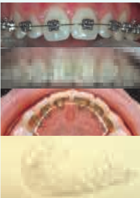
Figures: Metal, ceramic and lingual appliances, and a clear aligner.

Most people are referred by the family dentist for an orthodontic assessment and possible orthodontic treatment. Every child should have an orthodontic assessment by the age of 10 years. This is normally undertaken by the family dentist, who may refer to a Specialist in Orthodontics for further advice when an abnormality is detected. Please note that many children are referred too early to start orthodontic treatment. The majority of orthodontic treatment occurs when most of the adult teeth have erupted; usually between 12 and 14 years of age. However, some very simple treatments are